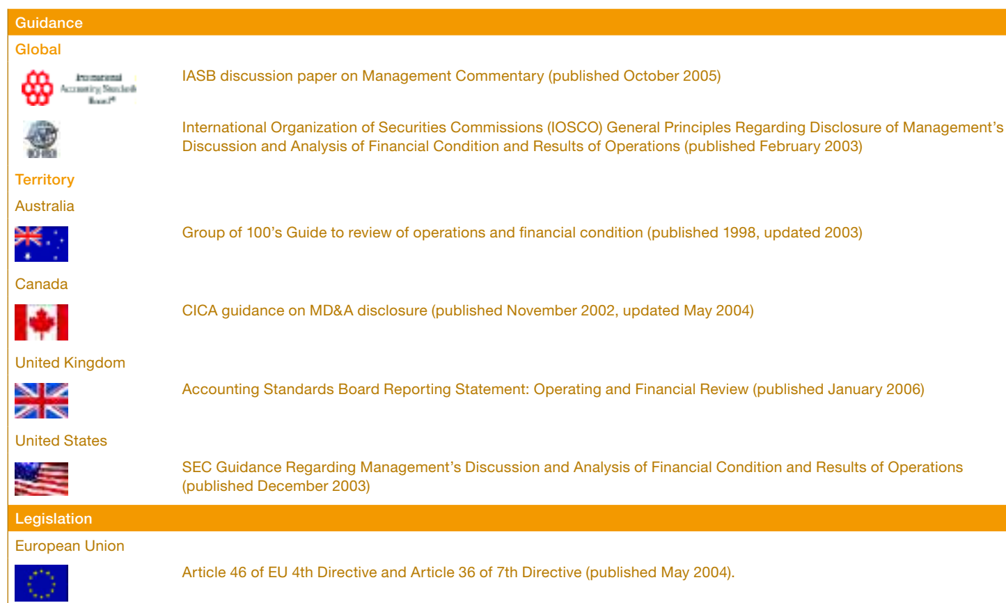
Exhibit 1: Examples of guidance and legislation on narrative reporting

Throughout this publication we consistently refer to the broader information set increasingly being demanded in annual reports. This delivery vehicle was chosen because of its familiarity globally. However, as you go through this publication, we would encourage you to consider how the challenges faced and the observation and recommendations made are as applicable to any other medium a company chooses to communicate in.