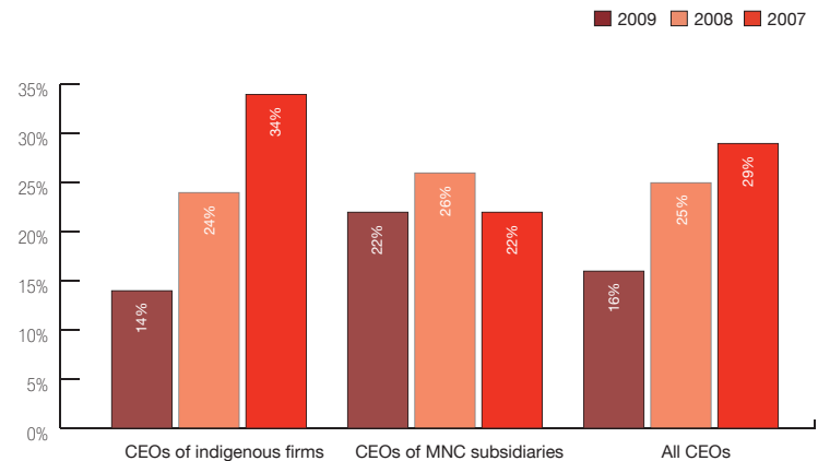
Figure 2.1 Satisfaction with the overall cost of doing business in Ireland (% of respondents satisfied)

As the competitiveness of our economy continues to suffer it is not surprising that an overwhelming majority (84%) of Irish business leaders are not happy with the overall cost of doing business in Ireland. As in previous years, CEOs of MNCs are more satisfied with the cost of doing business in Ireland (22%) when compared with their Irish counterparts (14%). See Figure 2.1 below.